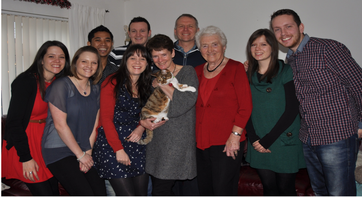
Christmas Day 2011